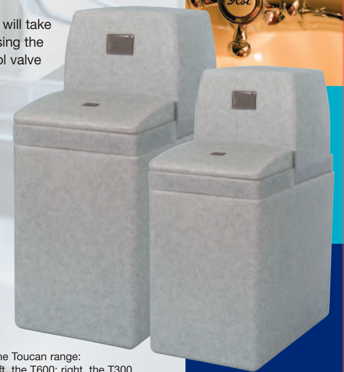
The Toucan range: left, the T600; right, the T300