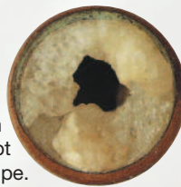
Cross section of a scaled hot water pipe.

It is responsible for the scum, scale and tidemarks found around sinks, basins and baths. A common example is around your shower heads and taps where the visible sign is the limescale build up. However, the unseen damage of hard water is the clogging up of pipes as shown in the picture. When left untreated, hard water can cause irreversible damage and result in the failure of central heating systems, washing machines and dishwashers.